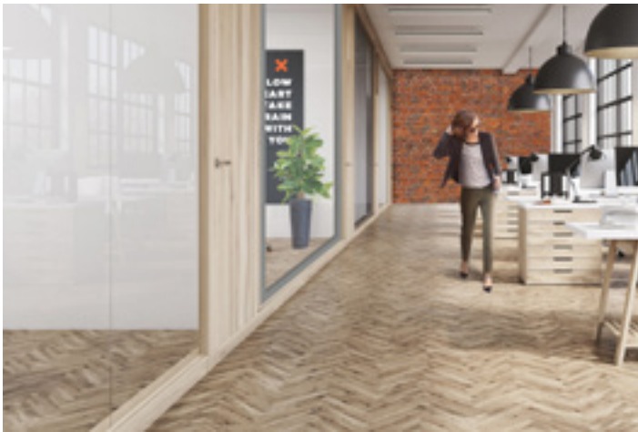
ON Unique partition wall

SEE WHAT OPPORTUNITIES ARE OFFERED BY THE 'PLUG AND PLAY' SYSTEM