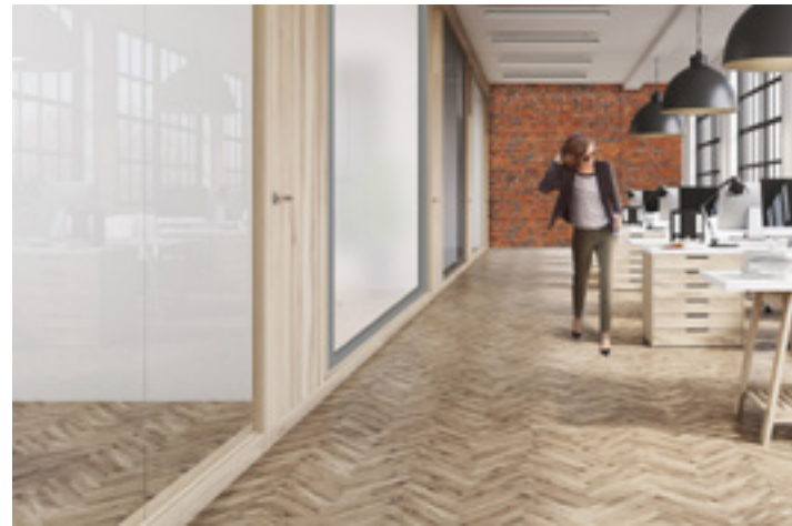
OFF A unique partition wall, which will guarantee access of the natural light, or privacy in its opaque state.