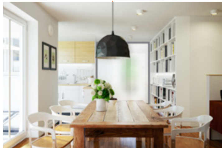
OFF Installed in a wall opening, it will give an effect of an extraordinary internal window, the transparency of which can be changed by means of a remote control.